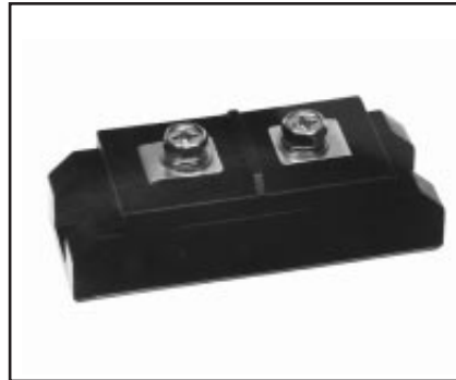
CS640525 Fast Recovery Single Diode Module 250 Amperes/500 Volts